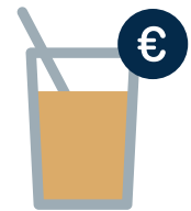
Making payments at the sports bar