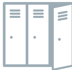
Opening your locker